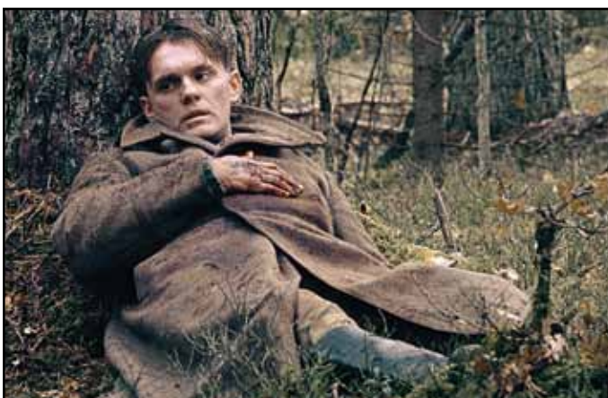
IN THE FOG, March 16, 20