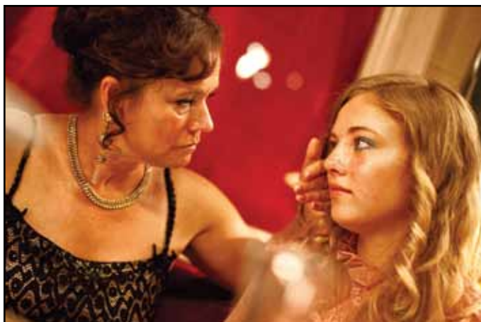
CALL GIRL, March 24, 26