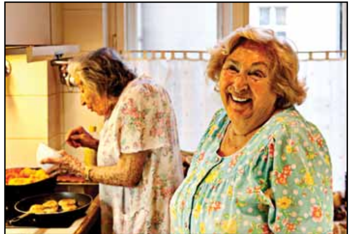
OMA & BELLA, March 10, 12