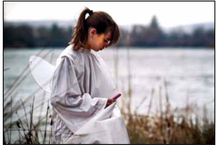
ICEBERG, March 23, 26