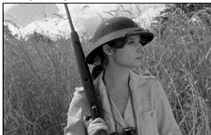
TABU, March 2, 6