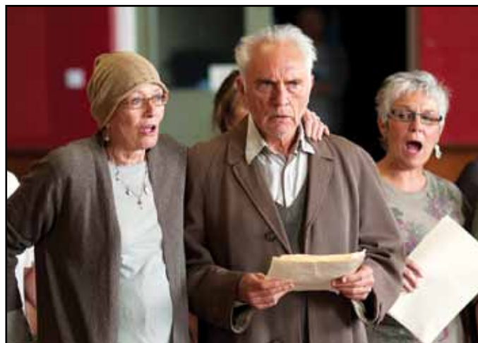
UNFINISHED SONG, March 3, 4