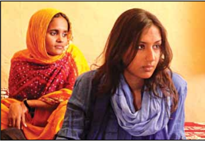
WILAYA, March 8, 14