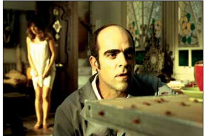
SLEEP TIGHT, March 31, April 3