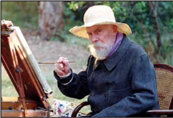
RENOIR, March 9, 13