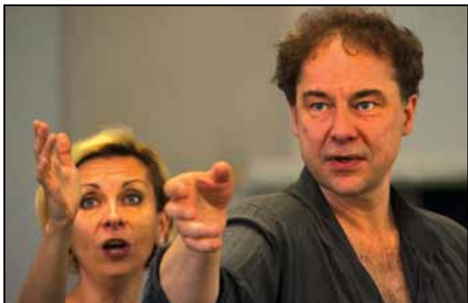
BECOMING TRAVIATA, March 23, 27