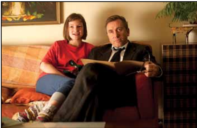
BROKEN, March 16, 20