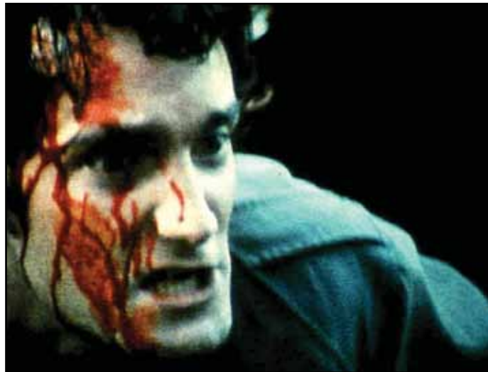
A GRIN WITHOUT A CAT, Feb. 22, 26, March 5

A GRIN WITHOUT A CAT is master documentarian Chris Marker's epic account of the rise and fall of the New Left. Part Two, "Severed Hands," analyzes the movement's tortuous decline, both from outside aggression