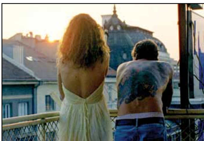
FAITH, LOVE & WHISKEY, March 2, 4