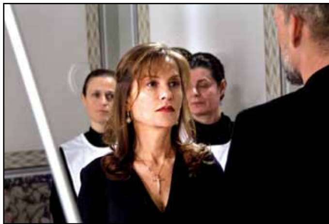
DORMANT BEAUTY, March 22, 24