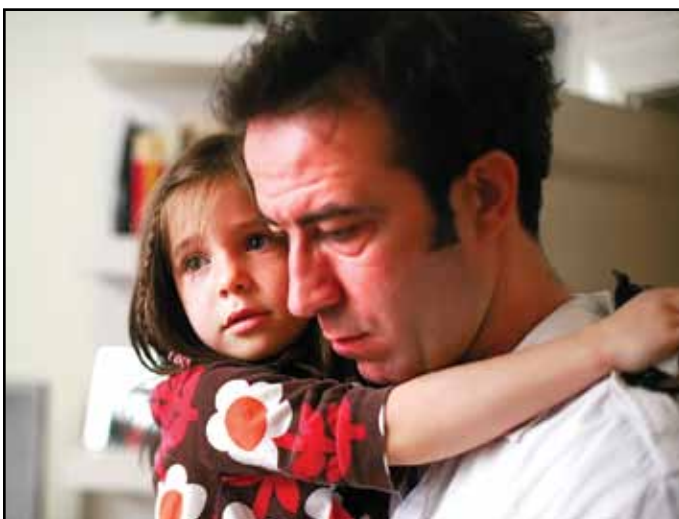
EVERYBODY IN OUR FAMILY , March 3, 4