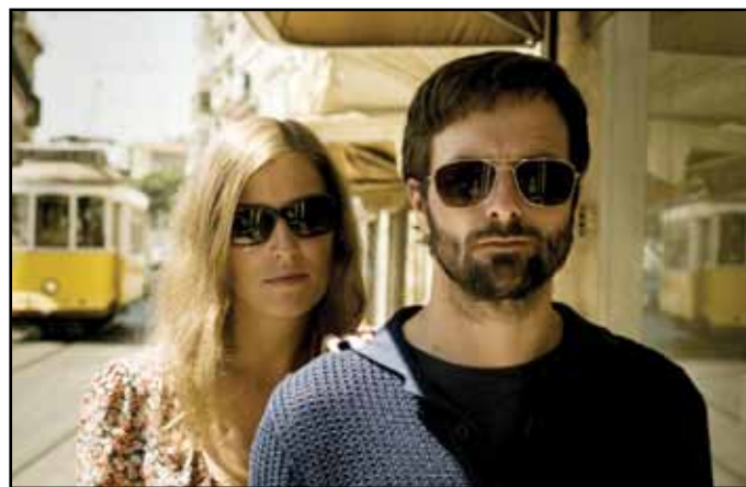
IMAGINE, March 24, 27