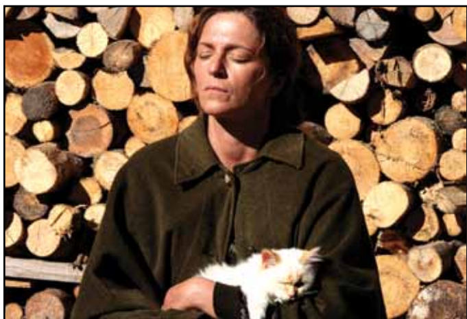
THE WALL , March 3, 6