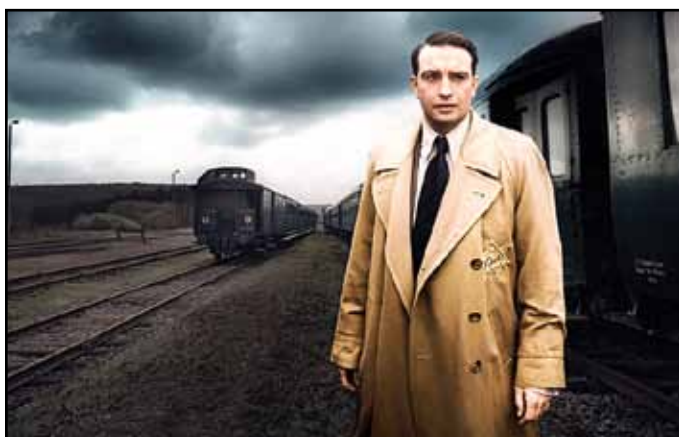
SÜSKIND, March 14, 17