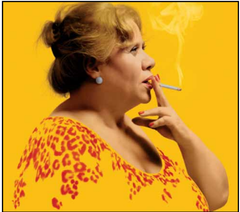
CARMINA OR BLOW UP, March 6, 9

In the European Union Film Festival and the Festival of New Spanish Cinema: