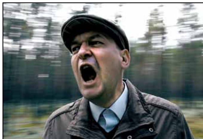
MUSHROOMING, March 9, 13