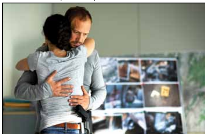
BLIND SPOT, March 2, 4