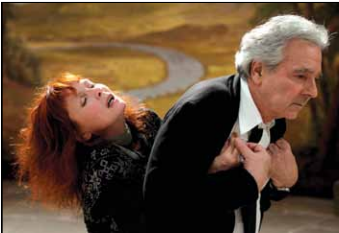
YOU AIN'T SEEN NOTHIN' YET, March 17, 21