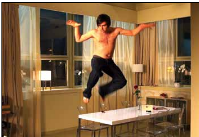
PERFECT DAYS, March 8, 9