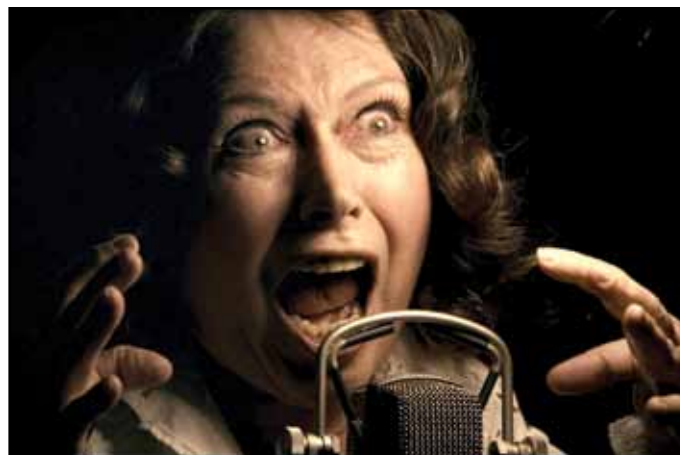
BERBERIAN SOUND STUDIO, March 9, 11