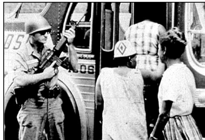
FINALLY GOT THE NEWS, March 12

(in Czechoslovakia and Chile) and internal dissension. In French, Spanish, English, and German with English subtitles and English voiceover narration. 35mm. (MR)