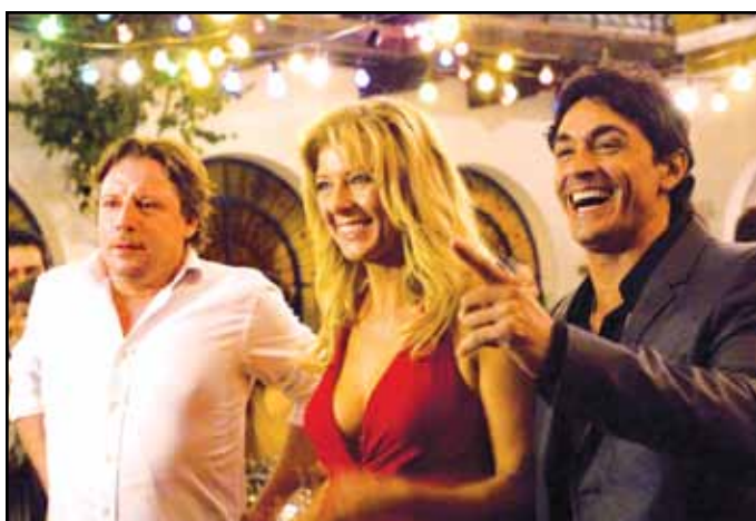
SUPERCLÁSICO, March 2, 5