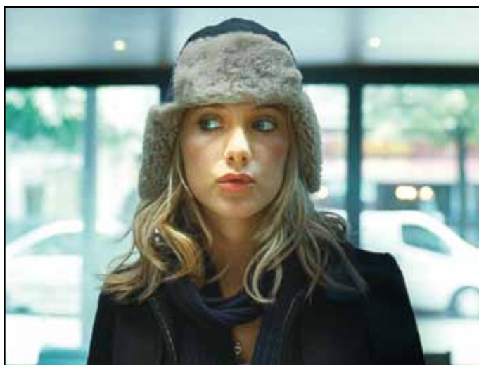
THE DAY I SAW YOUR HEART, March 3, 7