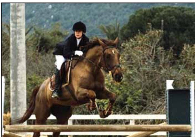
HANNIBAL ANTE PORTAS, March 15, 18