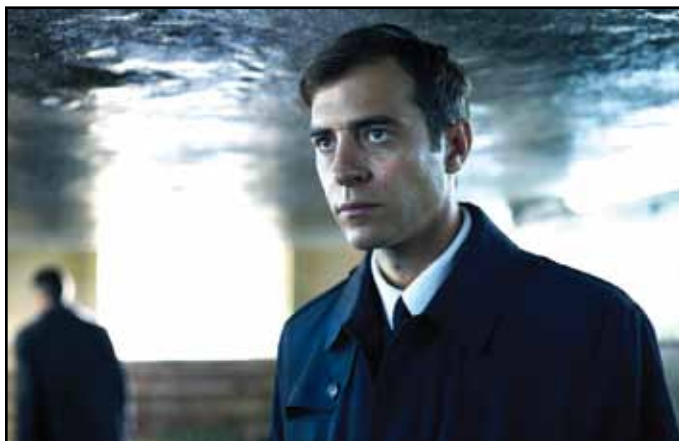
THE COLOR OF THE CHAMELEON, March 10, 11