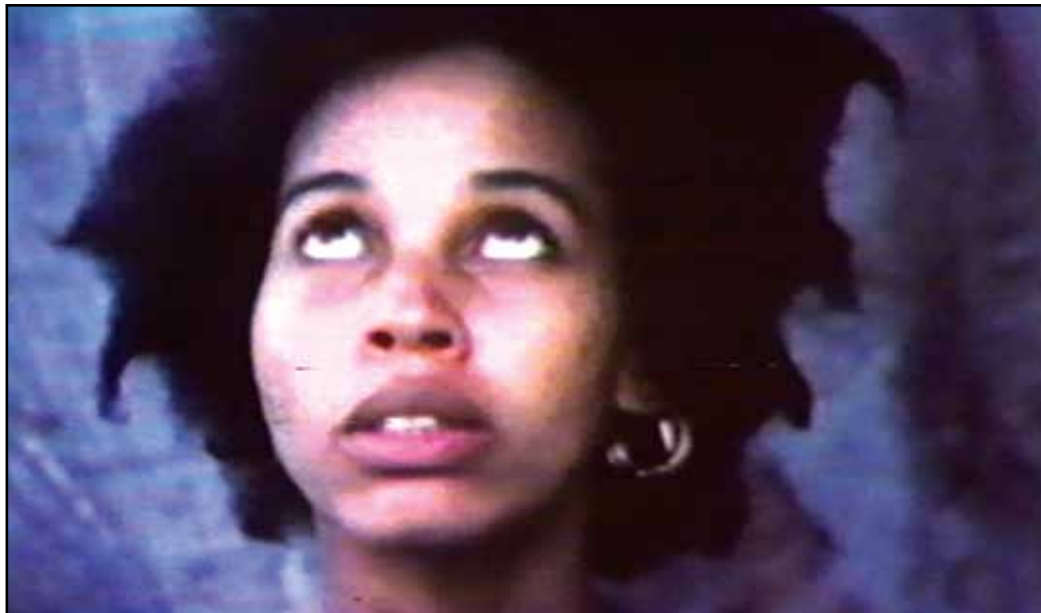
L.A. Rebellion, March 28

A compendium of works featured in the Toronto International Film Festival's celebrated Wavelengths program. Curated by Andréa Picard, who has headed the avant-garde section since 2006, this screening features the Chicago premieres of