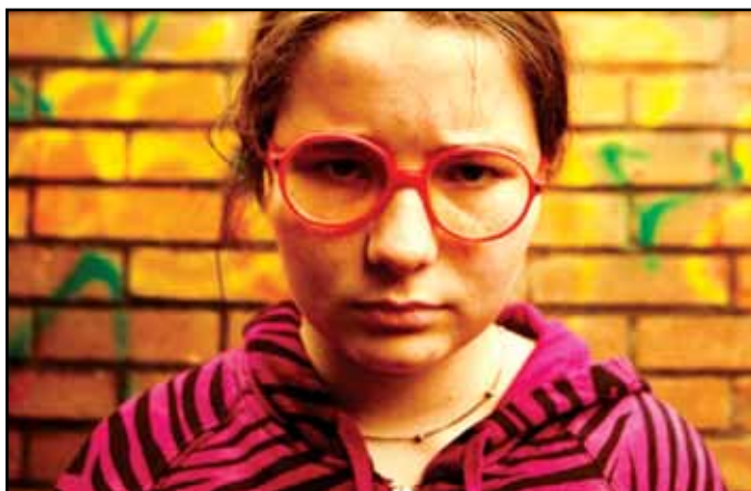
THE DEFLOWERING OF EVA VAN END, March 23, 27