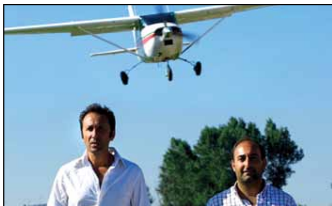
MAGIC HOUR, March 9, 11