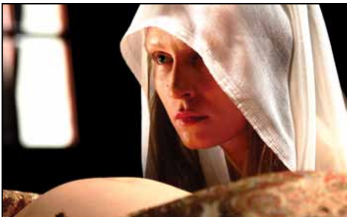
GULF STREAM UNDER THE ICEBERG, March 10, 12