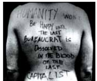
ICE, March 26

This pioneer music documentary is a record of the three-day Monterey International Pop Festival at the beginning of 1967's Summer of Love. Cinéma-vérité giant Pennebaker captures a wealth of legendary performers and performances, including Janis Joplin's ferocious "Ball 'n' Chain," Jimi Hendrix's fiery "Wild Thing," and the late Ravi Shankar's mesmerizing sitar finale. HDCAM video. (MR)