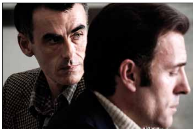
PIAZZA FONTANA, March 10, 14