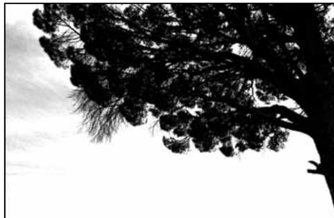
Wavelengths: in the blink of an eye, March 21