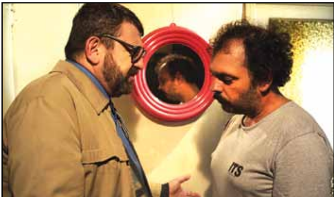
CHASING RAINBOWS , March 15, 18