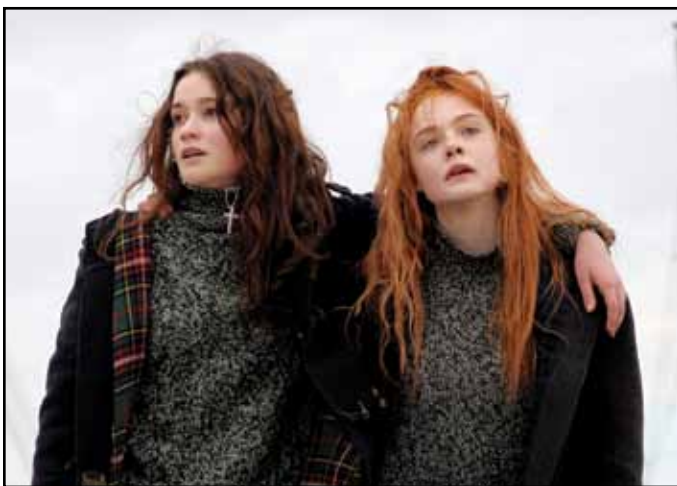
GINGER & ROSA, March 2