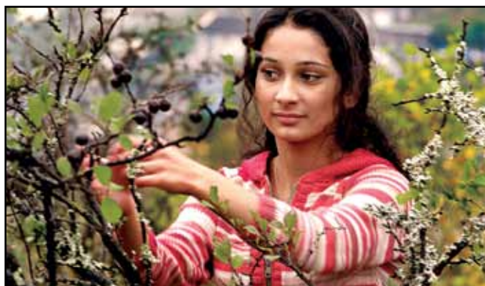
GYPSY , March 2, 7