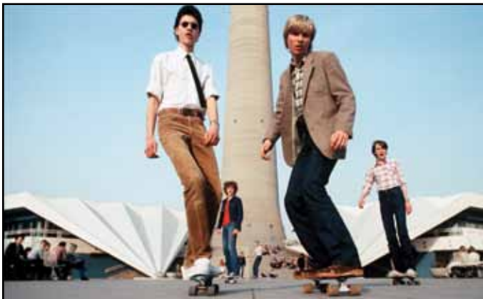
THIS AIN'T CALIFORNIA, March 22, 23