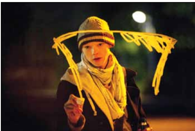
DEATH OF A SUPERHERO, March 23, 27