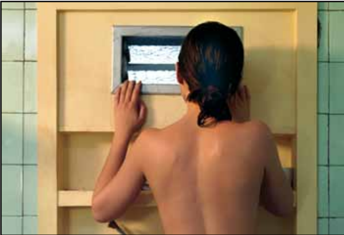
MADRID, 1987, March 17, 19