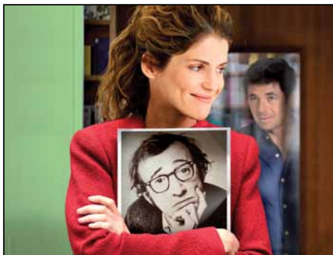
PARIS-MANHATTAN, March 10, 14