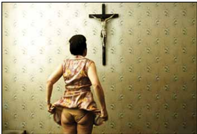
PARADISE: FAITH , March 17, 21