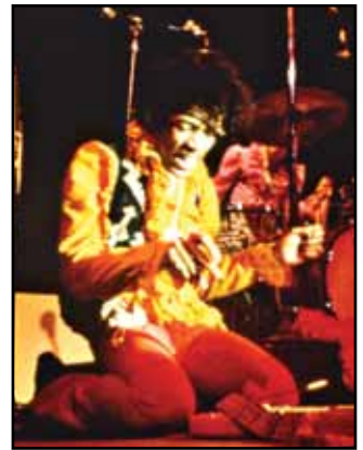
MONTEREY POP, March 19