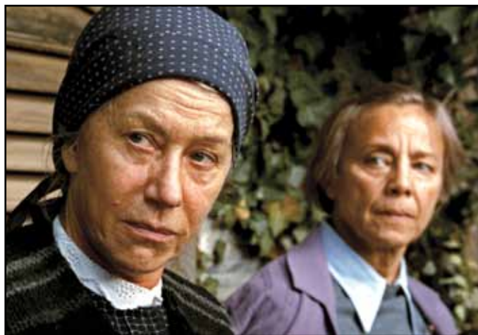
THE DOOR, March 22, 25