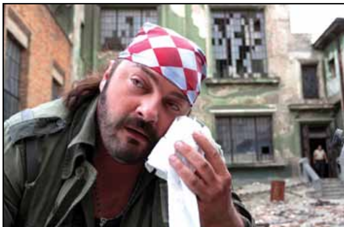
THE PARADE, March 17, 19