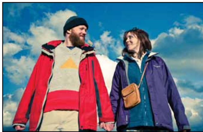
SIGHTSEERS, March 2, 7