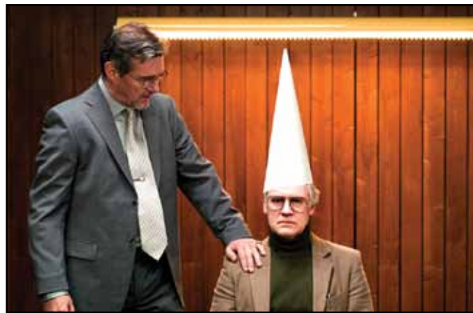
FLICKER, March 9, 11