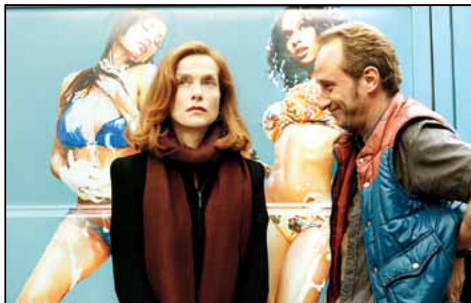
MY WORST NIGHTMARE, March 16, 18, 28