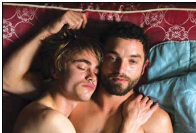
BEYOND THE WALLS , March 23, 25