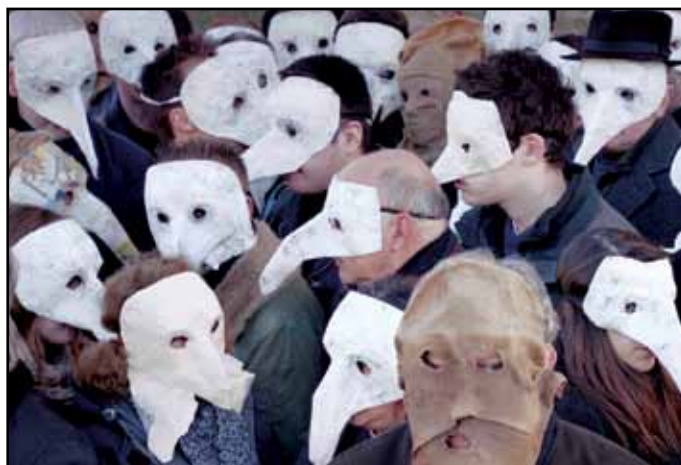
THE FIFTH SEASON , March 3, 6