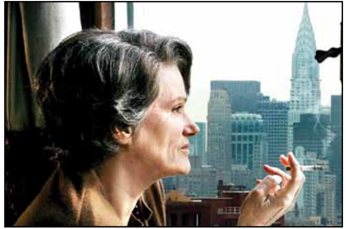
HANNAH ARENDT, March 8