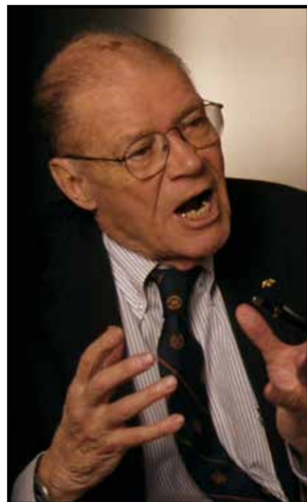
THE FOG OF WAR, April 18, 21

The subject of this incisive essay film is the sea, not as a traditional domain of romantic adventure, but in its modern (and often invisible) role as a bulwark of global capitalism. In English, Dutch, Indonesian, Mandarin, Spanish, and Korean with English subtitles. HDCAM video. (MR)