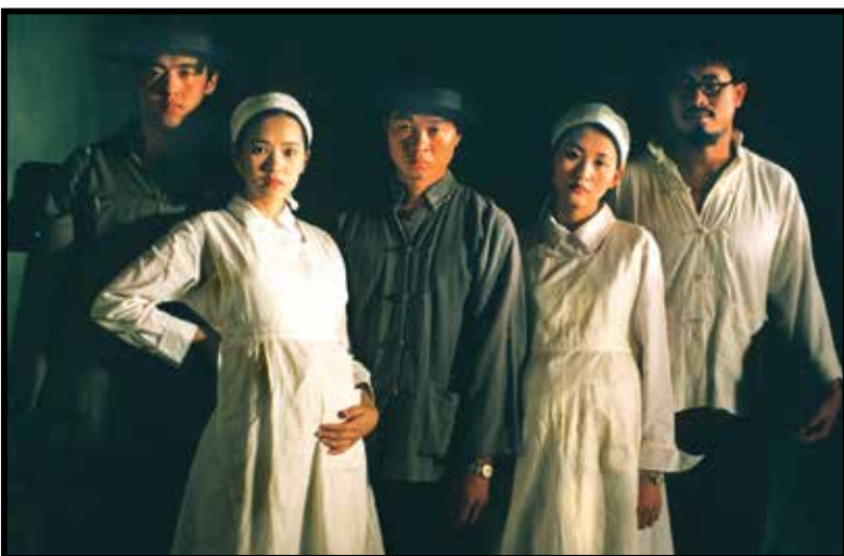
GOOD MEN, GOOD WOMEN, April 26, 29