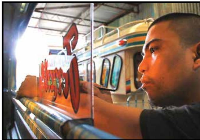
JEEPNEY, April 5