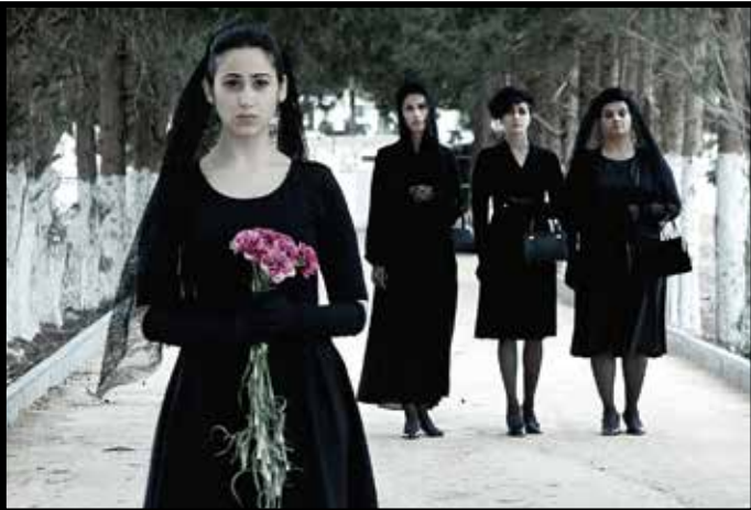
VILLA TOUMA, April 24, 25