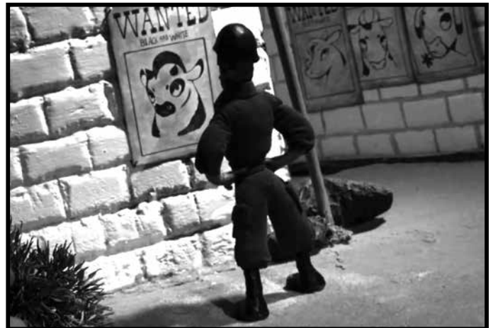
THE WANTED 18, April 28