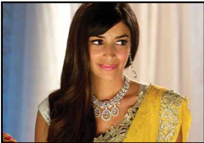
MISS INDIA AMERICA, April 4