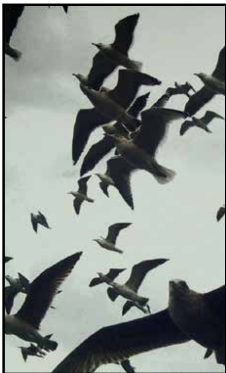
LEVIATHAN, April 4, 7