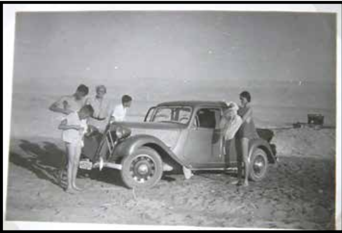
ENCOUNTER WITH A LOST LAND, April 20