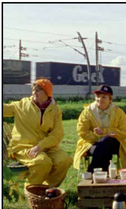
THE FORGOTTEN SPACE, April 10, 14

Using an array of tiny waterproof cameras, filmmakers/artists/ethnographers Castaing-Taylor and Paravel take us on an immersive voyage aboard a fishing trawler out of New Bedford. DCP digital. Note: Squeamish viewers might find the film unpalatable. (MR)