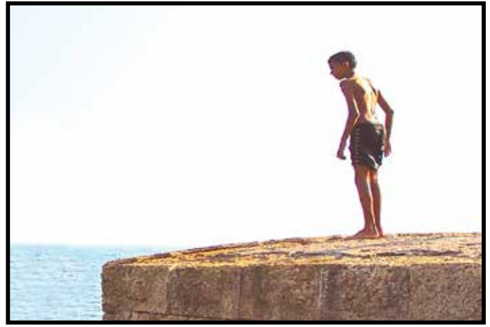
IT'S BETTER TO JUMP, April 23