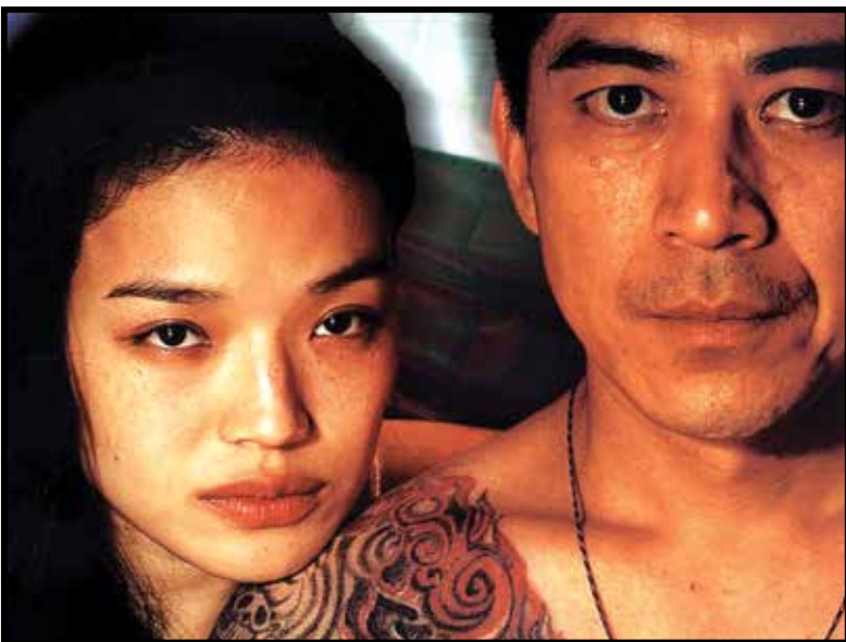
MILLENNIUM MAMBO, April 17, 19