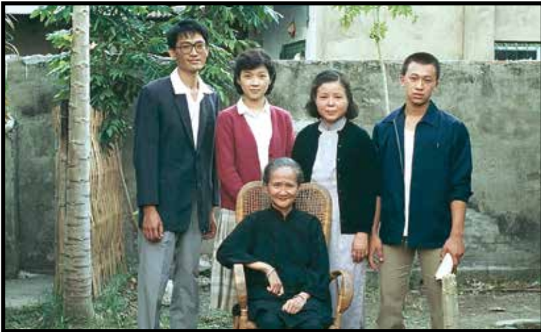
A TIME TO LIVE AND A TIME TO DIE, April 10, 11