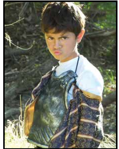
Projections, April 23

Conversations at the Edge is a weekly series of screenings, artist talks, and performances by some of the most compelling media artists of yesterday and today.