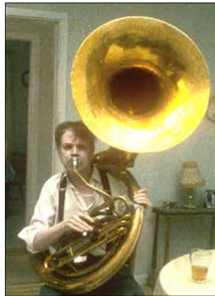
YOU, THE LIVING, March 28

A virginal teenager in Gravesend, Brooklyn, sets her sights on a college boy rumored to sleep around indiscriminately. One of the most exciting directorial debuts in recent years. DCP digital. (CW)