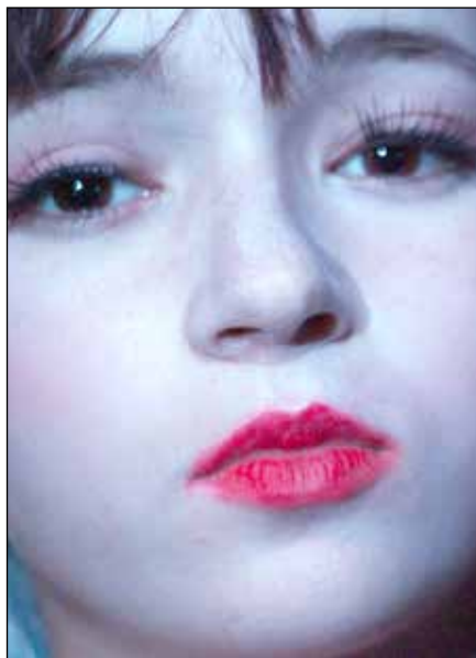
IT FELT LIKE LOVE, March 21

At odds with her dull hometown, Marina makes furtive steps towards the adult relationships that have eluded her. A landmark of the "Greek weird wave." In Greek with English subtitles. 35mm. (CW)