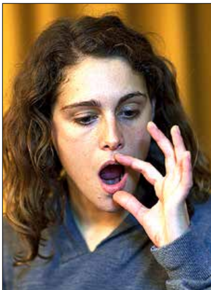
ATTENBERG, March 14